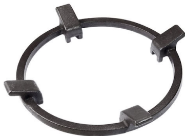
Cast iron wok support 9601 727